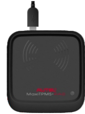
Connect Type B plug to the PAD.