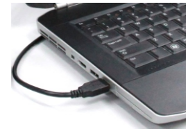
Connect Type A plug to the PC.